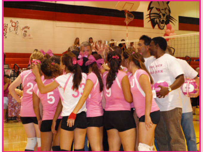
Ignacio High School is "Home of Pink Digs for a Cure." Picture: BP America, our 2010 Pink Sponsors, IHS Student-Athletes, and the 2010 All-Star Survivors Team come together in celebration of courage. All net proceeds benefit our local community neighbors.

We are partnering with community businesses to raise contributions for local, in-treatment breast cancer patients. One hundred percent of net proceeds directly benefit diagnosed patients with Emergency Fund Scholarships through the Women's Health Coalition of Southwest Colorado. The Emergency Fund assists patients with medical and household expenses attached to in-treatment challenges.